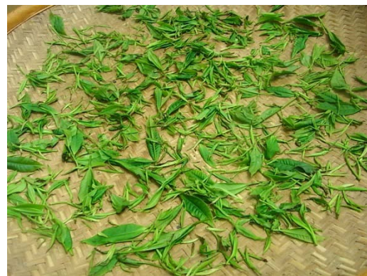
Harvested wild tea leaves prior to processing

Wild Taiwanese Teas from the ancient forests above Puli are a Tillerman Exclusive