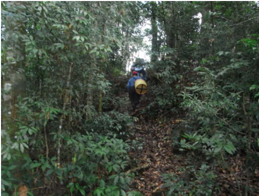
Entering the mountaintop tea “forests” above Puli

The wild growing tea trees on the mountaintops above the Puli in Nantou County, Taiwan are unknown even to many lifelong members of the Taiwan tea trade. These plants, which are hundreds of years old, grow well above the cultivated tea gardens in the region.